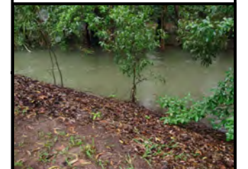
DIA 9 - Yankee Pools