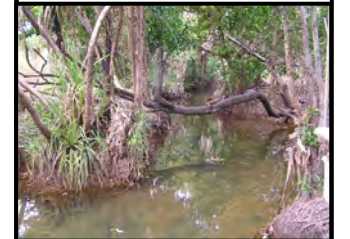
DIA 8 - Wier