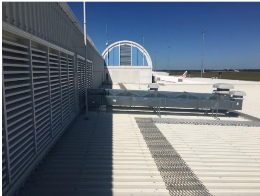
Photo 7.4.1 - Area A walkway

Any works conducted within 3 metres of the exposed edge on the East or West ends must not be done without an approved TBRA approved by the DIA Health & Safety Manager or approved delegate.