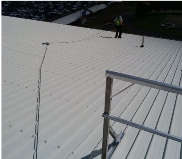
Photo 7.4.2 – Area B west - showing typical belaying to edge of roof.