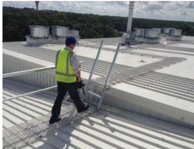
Photos 7.4.4 - west end ladder from Area A to Area D & walkway to Area D west