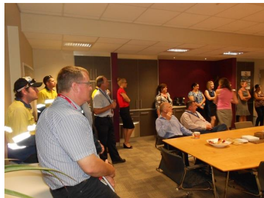
SWAM 01 - Safe Work Australia Month – Launch