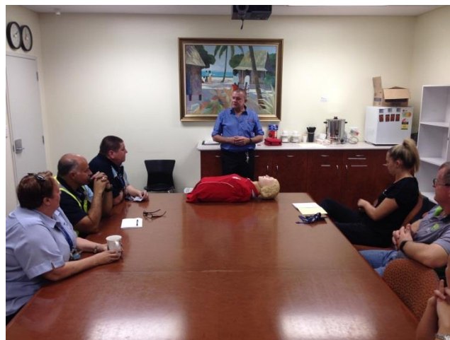
SWAM 04 – CPR & defib – St John Ambulance

Refresher training was provided for CPR and Defibrillator by St John Ambulance over two days. There were 15 attendees over the two days.