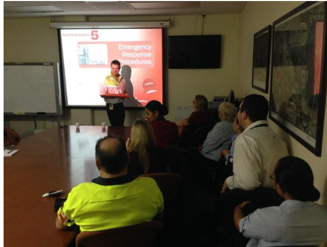
SWAM 12 – Fire Warden training – First Five Minutes

First Five Minutes provided warden training for airport tenants. There were 28 attendees including 16 different airport stakeholders and NT airports staff.