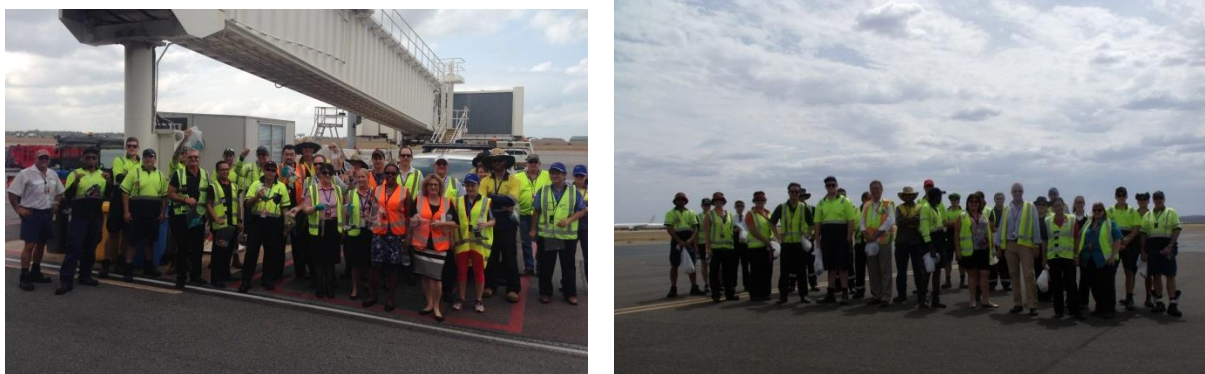
SWAM 11 – FOD Walk – Darwin & Alice Springs airports

All airports across Australia and New Zealand conducted FOD walks on their airports. At Darwin and Alice Springs this included a sausage sandwich and a cool drink after. There were 81 attendees over the 2 different airports including 16 different airport stakeholders as well as NT airports staff.